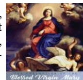
Blessed Virgin Mary

Assumption of Mary is a dogma of faith: “We pronounce, declare and define it to be a divinely revealed dogma that the immaculate Mother of God, the ever Virgin Mary, having completed the course of her earthly life, was assumed body and soul to heavenly glory.”