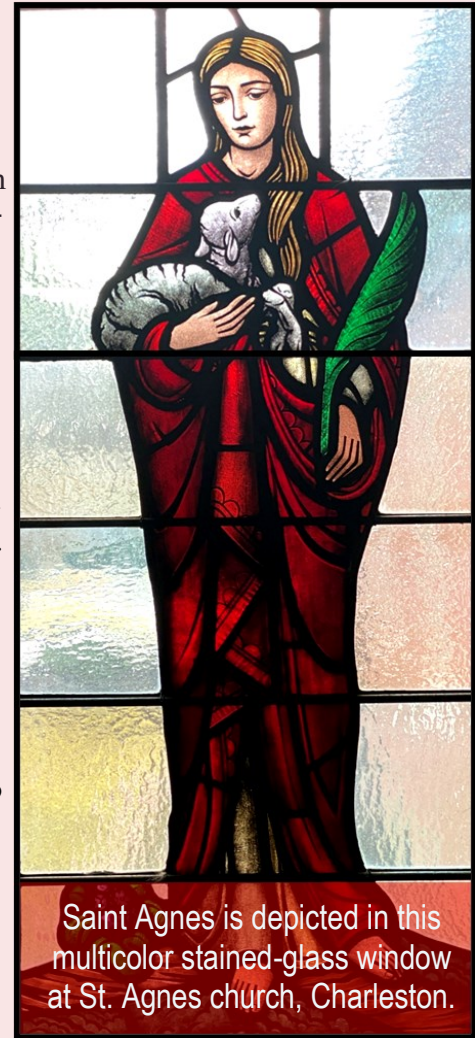
Saint Agnes is depicted in this multicolor stained-glass window at St. Agnes church, Charleston.

https://www.catholicnewsagency.com/saint/st-agnes-123