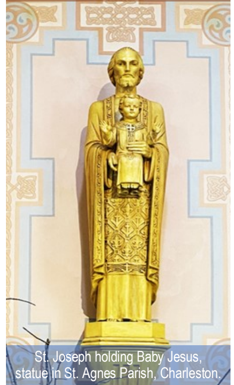
St. Joseph holding Baby Jesus, statue in St. Agnes Parish, Charleston.

On March 19th, we celebrate the holiness in the midst of unpredictable fatherhood. We first meet Joseph when he discovers his betrothed is pregnant...and not by him! St. Joseph does not know who the father is (yet), but he knows the punishment for adultery is death. He decides to divorce Mary quietly, and thus save her life. When an angel appears to reveal that Mary is pregnant by the Holy Spirit, St. Joseph trusts his dream and marries her. As a new foster father, Joseph must help his wife give birth in a stable. Later, he needs to escape the threats to his son's life by immigrating with his family to a foreign land. We know that St. Joseph is faithful, brave, and willing to sacrifice for those he loves. On the solemnity of St. Joseph, we don't merely celebrate a carpenter. We celebrate a hero!