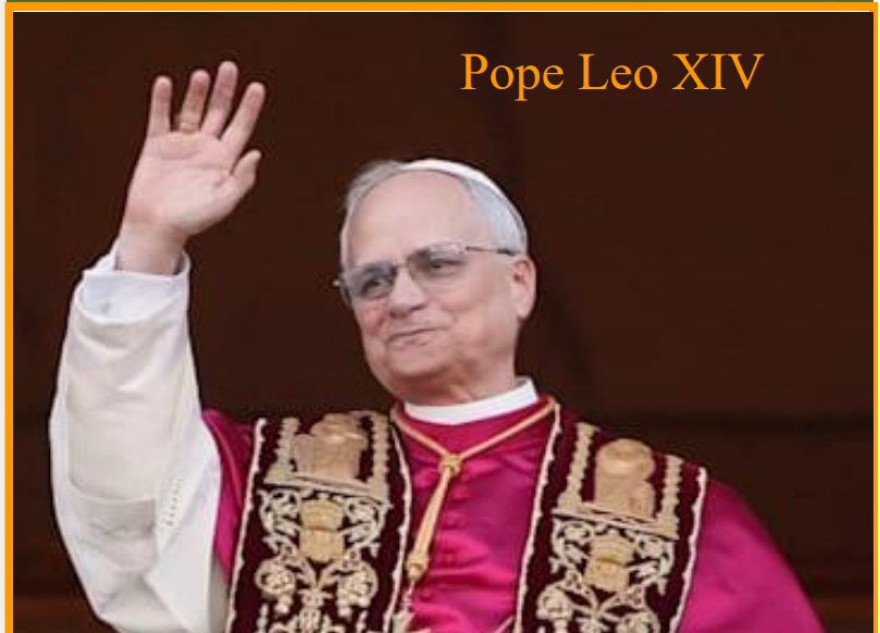
Pope Leo XIV